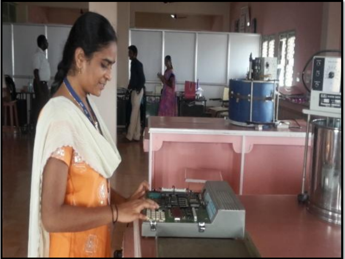
A student of II M.Sc. Physics performing a programme on addition two bits using Microprocessor 8085